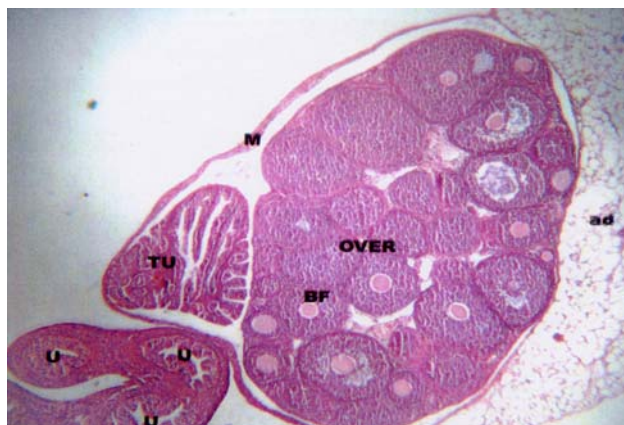
Fig. 1 View of follicles in an ovarian section from the study group. BF growing follicle, TU uterine tube, U fimbrial end, M mesothelium, ad perirenal adipose tissue. Hematoxylin-eosin \times 4

The mean volume of the right ovaries of pups was found to be 0.5 \pm 0.1 \text{ mm}^3 (0.3–0.7) in the study group and 0.6 \pm 0.2 \text{ mm}^3 (0.1–1.6) in the control group. Concerning the ovarian volume, a statistically significant difference was found between the two groups ( P = 0.005 ). In all sections obtained from the right ovary, all the follicles in every tenth section were counted and all of them were used in the calculation of follicle number for the right ovary of each rat. For one ovary, in all the sections obtained from every tenth section, the total number of follicles was averagely found as 475.4 \pm 155.4 (186–798)/right ovary in the study group, and as 757.5 \pm 275.9 (174–1333)/right ovary (Figs. 1, 2) in the control group. Statistically, when compared with the control group, the number of follicles was found to be significantly decreased in the study group ( P = 0.001 ; Fig. 3). The number of follicles per 1 \text{ mm}^3 , which was calculated